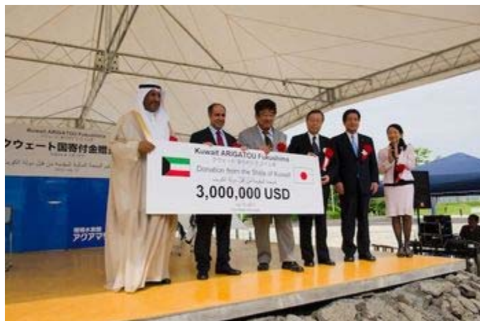
3 million dollars donated to Aquamarine Fukushima