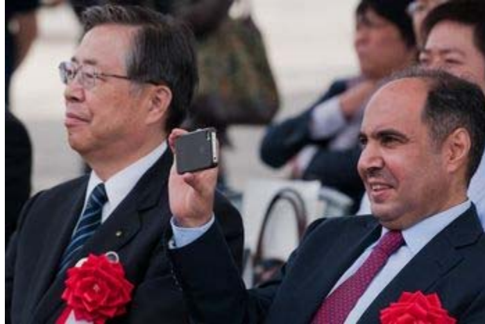
Governor and Ambassador enjoying the dance performance