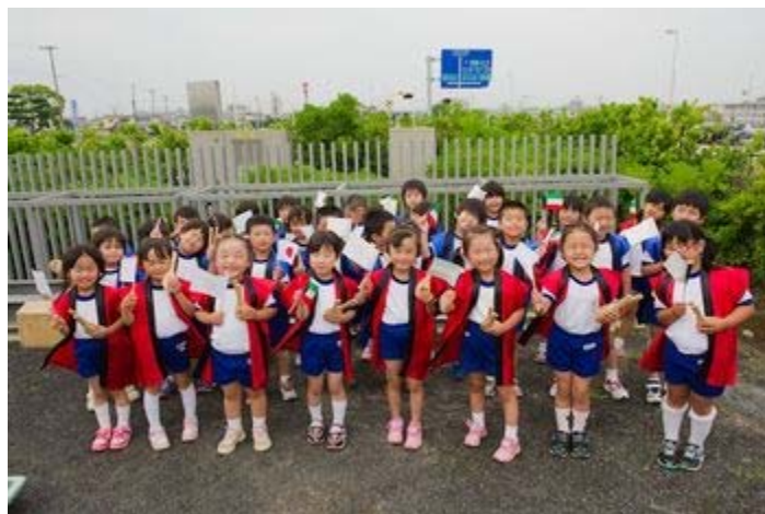
Children ready for the performance

Translated by PR 5 Office, Embassy of the State of Kuwait in Tokyo