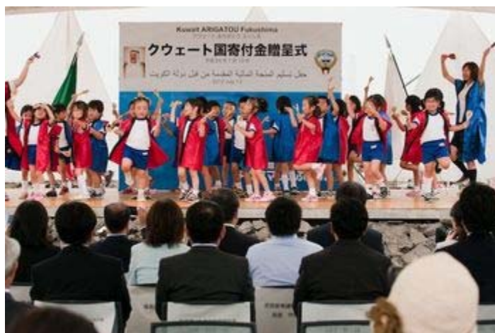
Yosakoi dance performance of Wakagi Kindergarten children