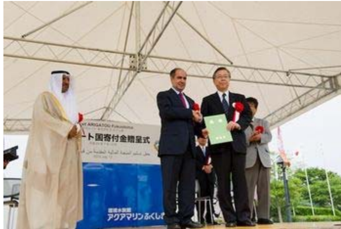
Governor handing Certificate of Appreciation to Ambassador